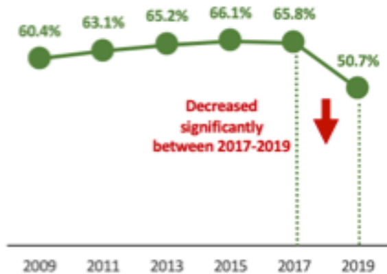
Maine 2019 MIYHS High School

50.7% say they have support from adults other than their parents